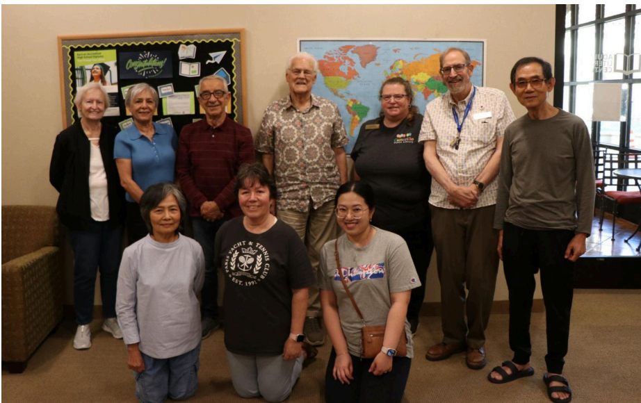
Adult Literacy Conversation Group

With the support of the State Library of California, the Camarillo Public Library began offering scholarships to Career Online High School (COHS) in August 2023. We currently have seven adult learners earning their high school diploma and a credentialed career certificate - one adult learner is in the process of earning her scholarship. COHS is fully accredited by Cognia (formerly AdvancED), meaning that COHS is recognized nationally as a quality school system that delivers an accredited high school diploma.