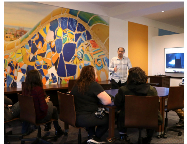
Pathways Beyond the Ordinary: Unconventional Job Series (March 2024)