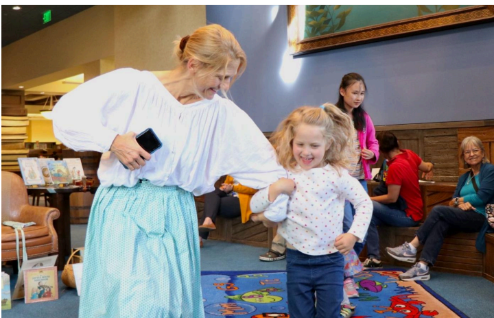
Women's History Month Children's Program (March 2024)

Our dedication to providing high-quality, enriching experiences for young community members remains steadfast year after year. Children's Services at Camarillo Public Library continues to innovate and adapt, ensuring that every child who walks through our doors discovers the joy of learning and power of imagination.