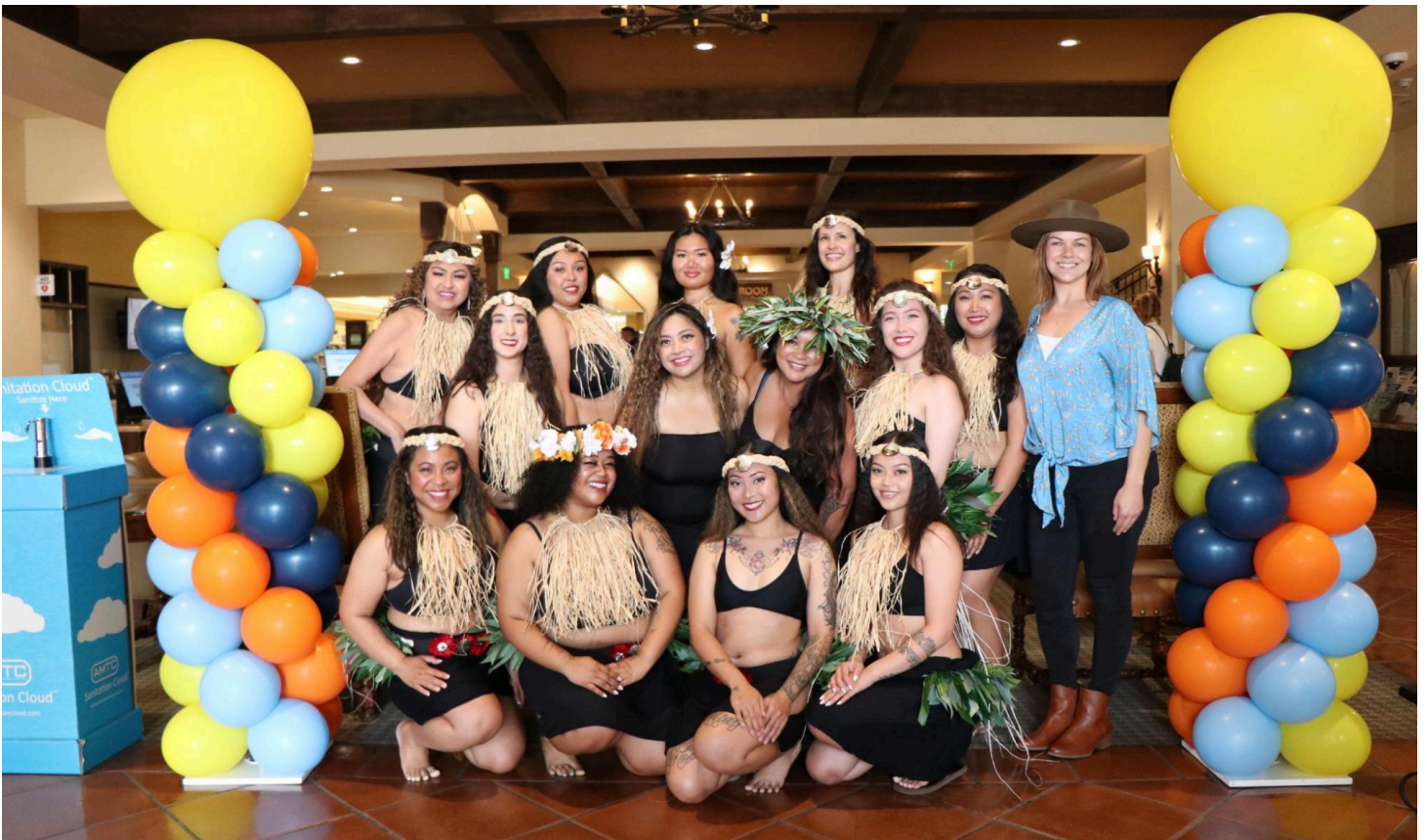
Camarillo Connections (May 2024)