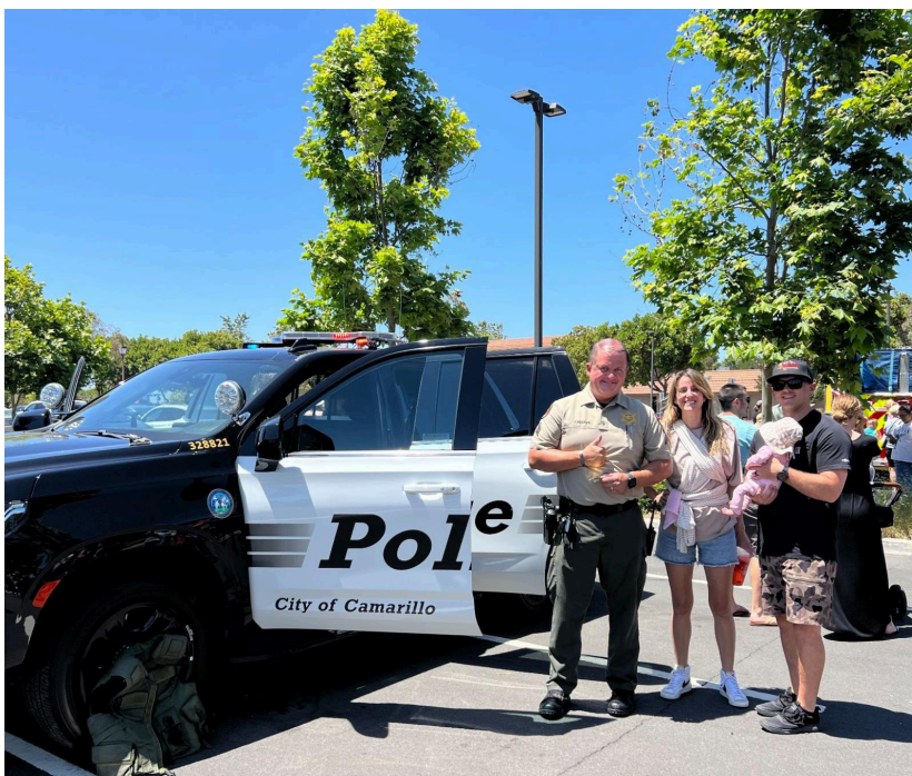
Touch-A-Truck (June 2024)

In tandem with the Touch-a-Truck event, we organized a vibrant bookmark contest that encouraged 130 patrons to showcase their creativity. The winning designs, professionally printed and available throughout the Library, symbolize our community's collaborative spirit and engagement.