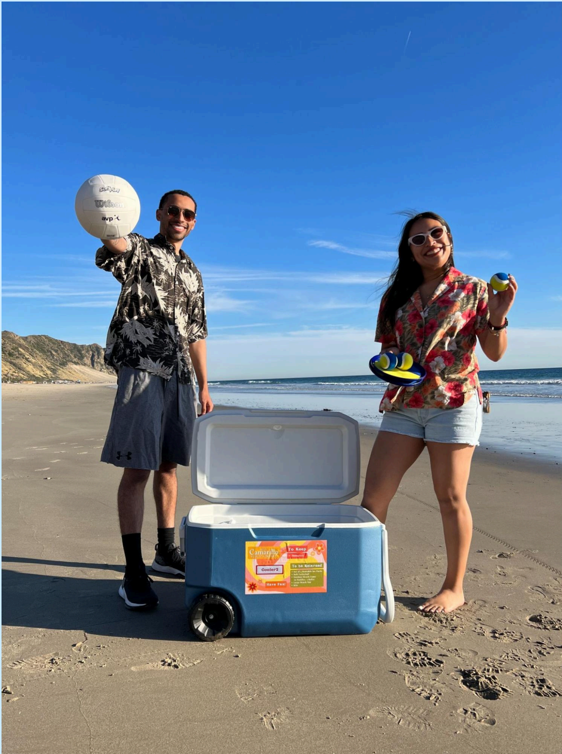
Beach Cooler made available with Parks Pass Grant