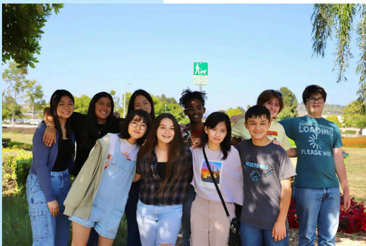
Teen Advisory Board (TAB)